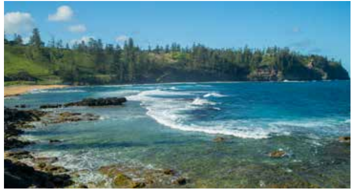
Images: Clockwise from top left – Glass roofed coach, towards Milford Sound; Colonial buildings, Norfolk Island; Cemetery Bay, Norfolk Island; Shotover River Canyons.